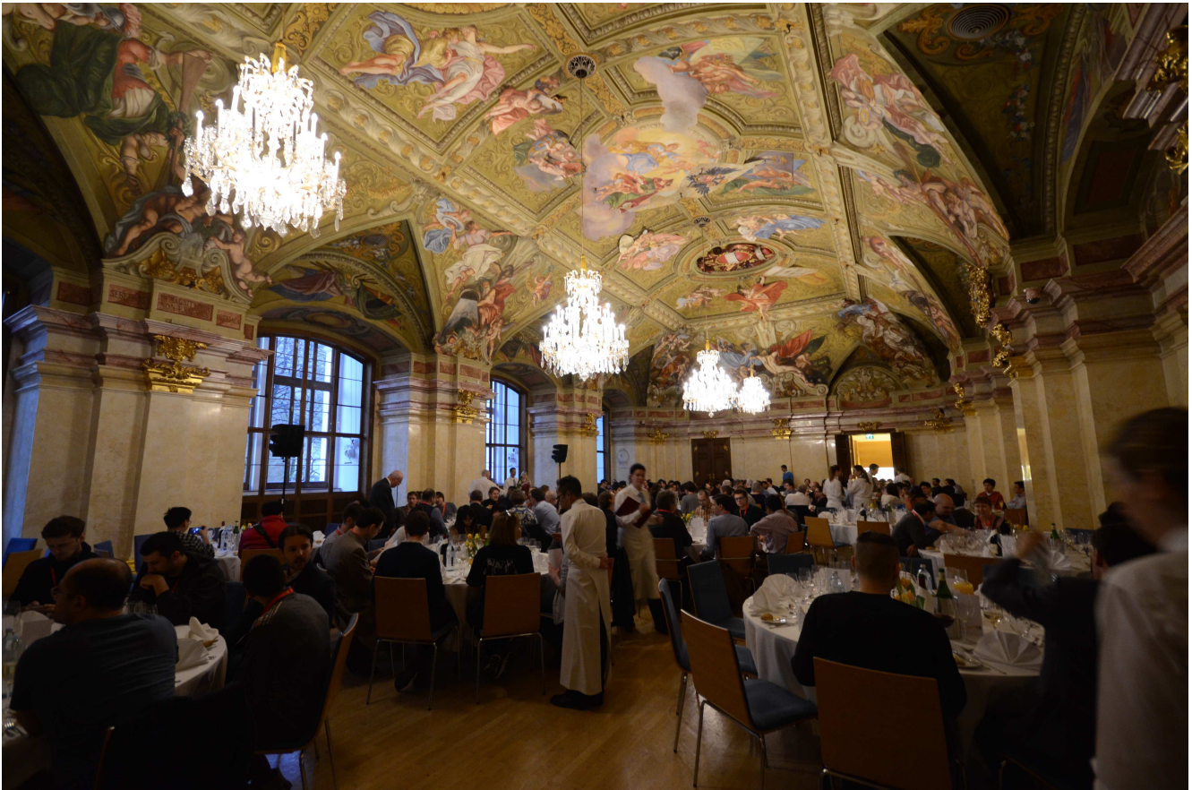
Figure 1: ECIR Conference Dinner at Palais Niederösterreich, Vienna